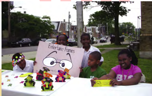
Children from Village Prevention Programs at Catharine, Mitchell, and Harrity elementary schools demonstrated their considerable entrepreneurial skills as part of the 4th Community Celebration, held May 29 at the Preheim Center. The children donated the proceeds to a charitable cause in their own community. To view lots of great photos from the event, go to our Village Facebook page at www.facebook.com . Search for Presbyterian Children's Village and scroll down to our photo album of the event.